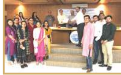
Participants accepting certificates