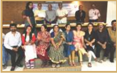
SPB Participants of NFDP