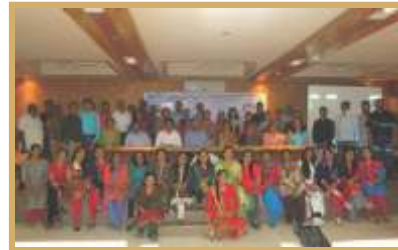
Participants of LDP