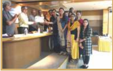
Participants accepting certificates