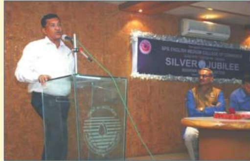
Vice Chancellor's Speech