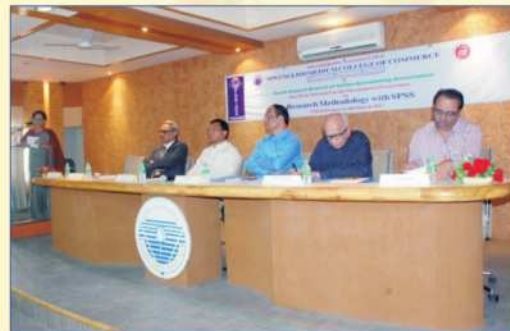
Dignitaries on the dias