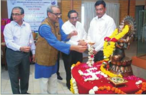
Lighting of Lamp