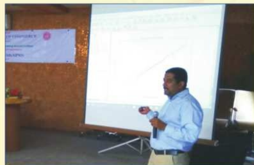
Sessions by Experts