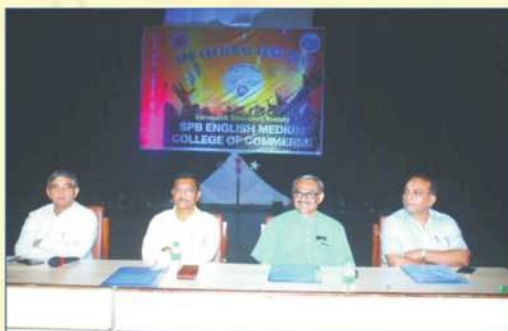
Dignitaries on the Dias