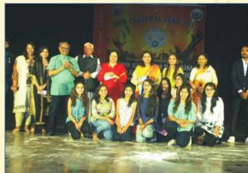
SPB Fest Dance Competition Third Prize Mamma's Angels