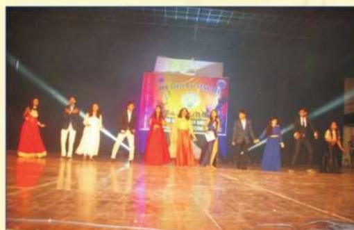
Students Compering the event