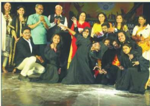
SPB Fest Dance Competition Second Prize Shakti Vrund