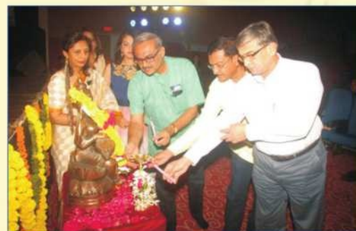
Lighting of Lamp