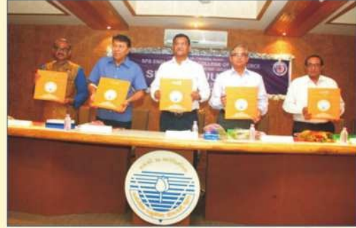
Release of 25 years silver jubilee souvenir