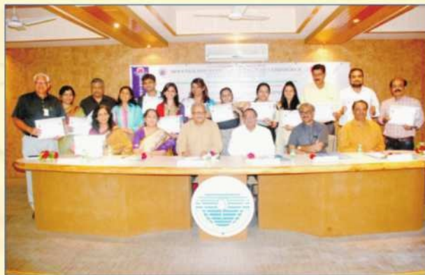
Distribution of certificate to College Faculties