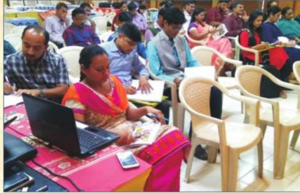
Participants of NFDPP