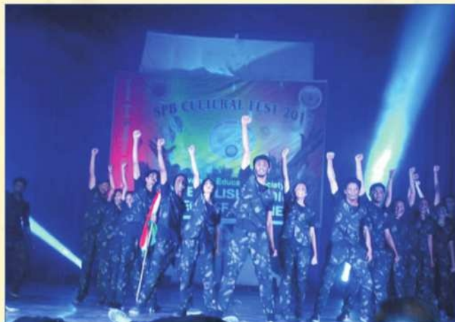
SPB Fest Dance Competition First Prize Zero Group