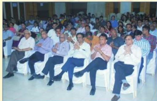
Guests and Invitees at the Function