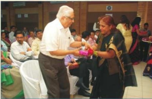
Welcoming the guests and invitees with flowers