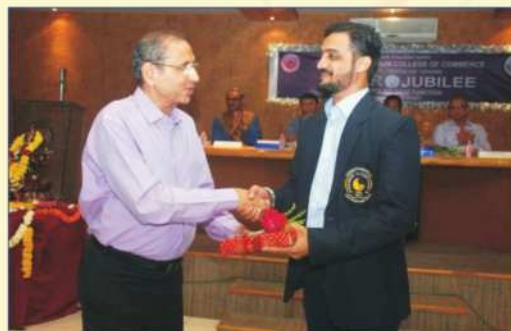
Honouring the Young Achievers