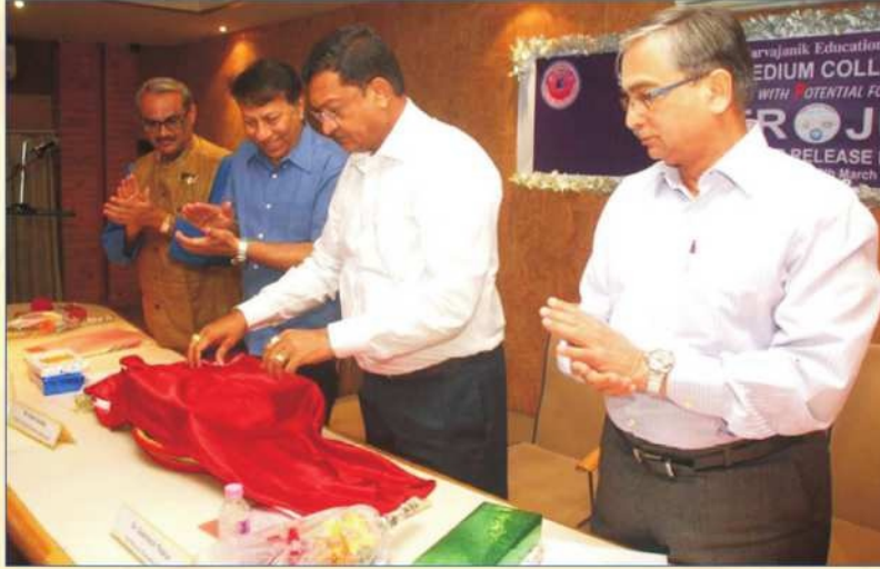
Release of 25 years silver jubilee souvenir