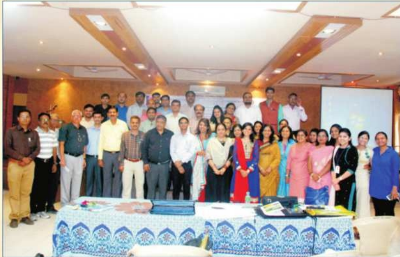
Participants Of National Faculty Development Programme